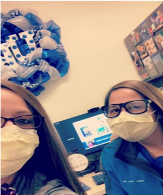
Baptist Health Hardin says hello from Elizabethtown!!!