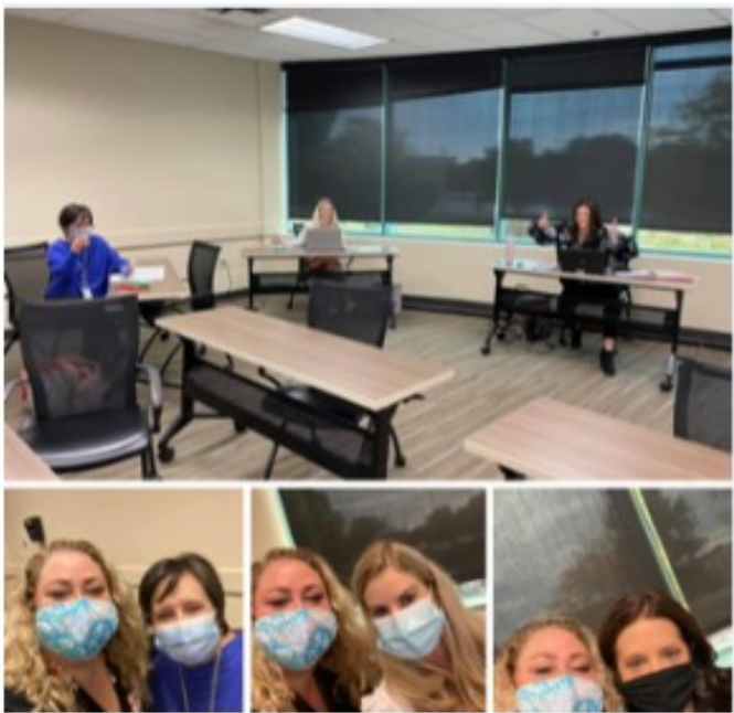
Facebook posts from the conference:

Hello everyone! We are enjoying the conference socially distanced at Owensboro Health!!!! A few of many attending from our hospital!